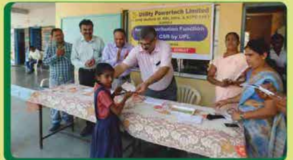
अलमीरा तथा यूपीएल मेधावी छात्र पुरस्कार प्रदत्त