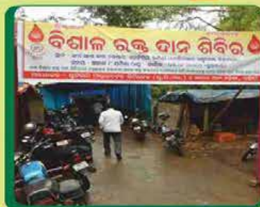
ब्लड डोनेशन कैंप का परिदृश्य