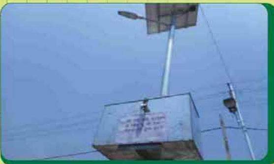
सौर ऊर्जा स्ट्रीट लाईट का परिदृश्य