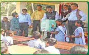
वाटर-फिल्टर का वितरण