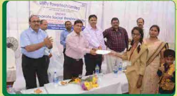
यूपीएल मेधावी छात्र पुरस्कार प्रदत्त