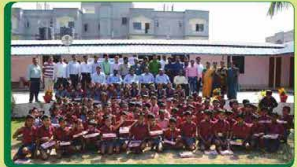
स्कूल-बैग एवम् यूपीएल मेधावी छात्र पुरस्कार का वितरण