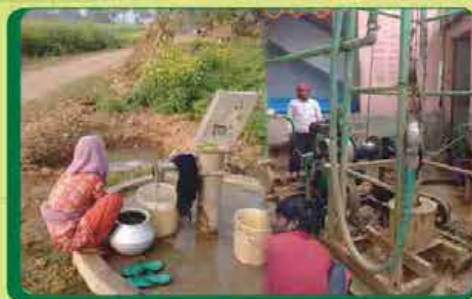
प्रदत्त हैंड पम्प एवम् बोरिंग का परिदृश्य