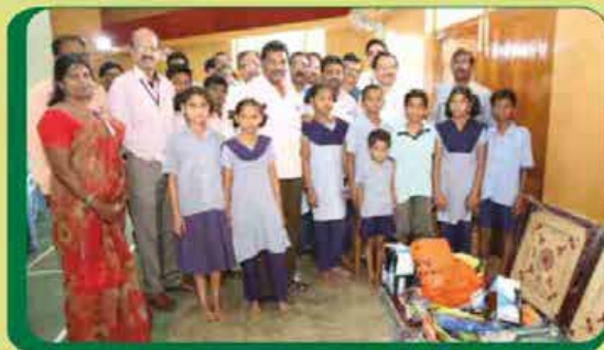
विभिन्न खेल सामग्रियों का वितरण