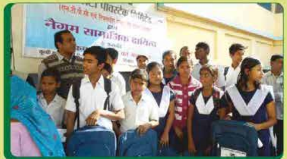
यूपीएल मेधावी छात्र पुरस्कार तथा स्कूल-बैग का वितरण