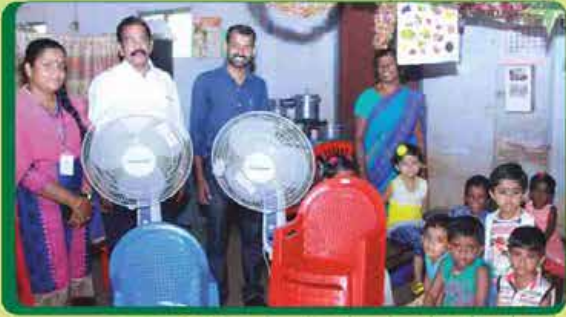
यूपीएल मेधावी छात्र पुरस्कार तथा पेडस्टल पंखें, कुर्सियों का प्रदान