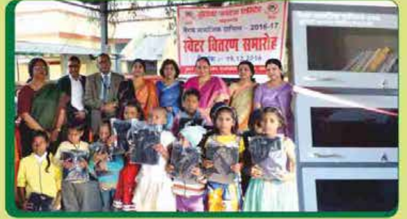
डेस्क-बेन्च, कम्प्यूटर, बुक-शेल्फ तथा स्वेटर का वितरण