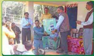
वाटर-फिल्टर का वितरण