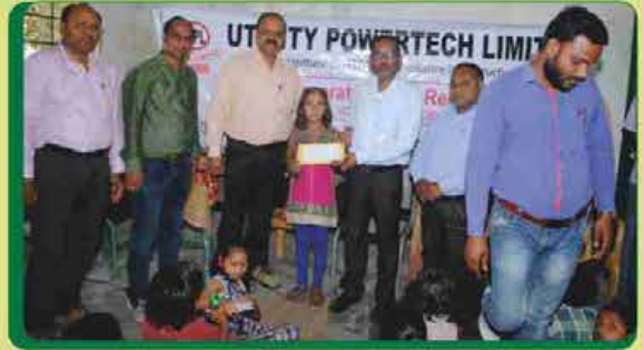
यूपीएल मेधावी छात्र पुरस्कार प्रदत्त