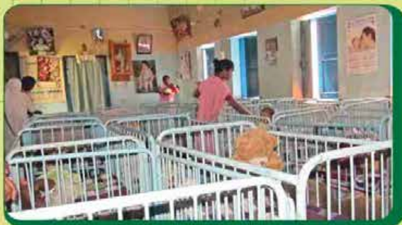
अनाथालय में लेक्टोजन बेबी मिल्क की भेंट