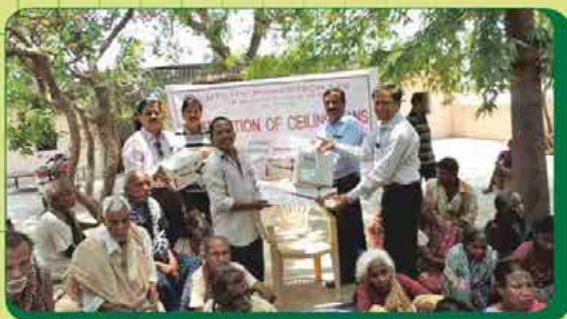
वृद्धाश्रम में पंखों का वितरण