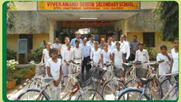
पंखे तथा साईकिल का वितरण