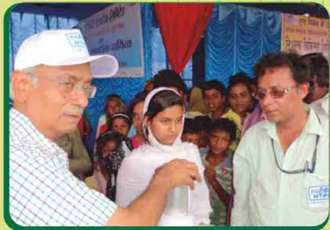
सौर लैम्प का वितरण