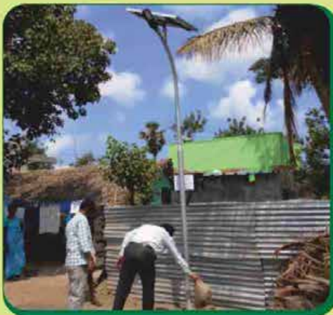
सौर ऊर्जा स्ट्रीट लाइट प्रदत्त