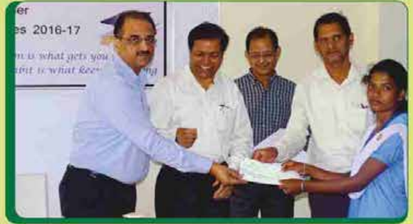
यूपीएल मेधावी छात्र पुरस्कार