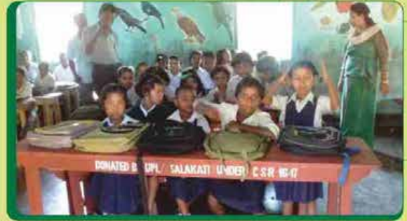
यूपीएल मेधावी छात्र पुरस्कार तथा बेन्च-डेस्क का वितरण