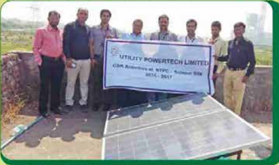
सौर ऊर्जा यूनिट की स्थापना