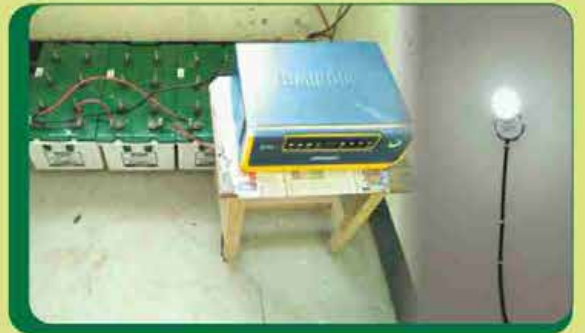
सौर ऊर्जा यूनिट की स्थापना का परिदृश्य