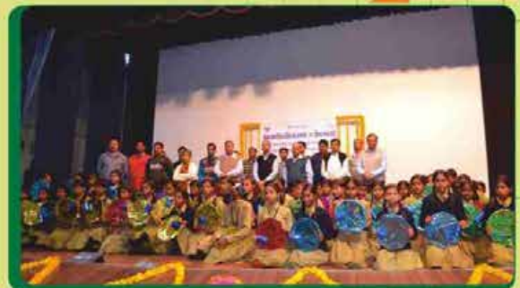
यूपीएल मेधावी छात्र पुरस्कार तथा मध्याह्न भोजन हेतु थाली-गिलास का वितरण