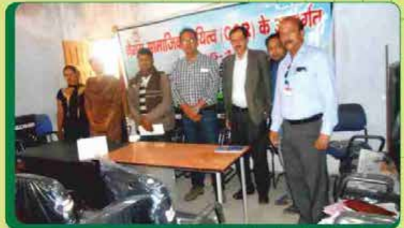
ब्लैक बोर्ड तथा कुर्सी-टेबुल का वितरण