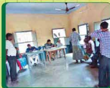
हेल्थ कैंप का परिदृश्य