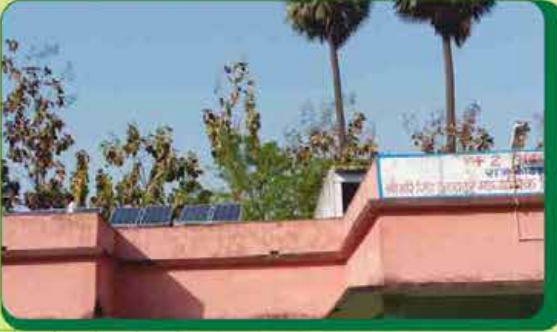
सौर ऊर्जा हाइब्रीड सिस्टम की भेंट