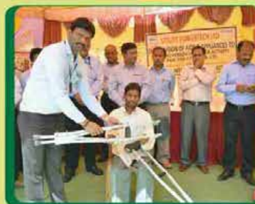
दिव्यांग को बैशाखी का वितरण