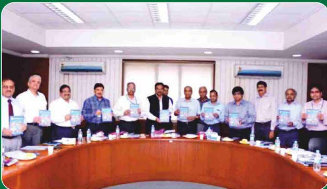
The photograph of the inaugural issue of UPL-CSR brochure for the Financial Year 2015-16

(A Joint Venture of Reliance Infra. Ltd. & NTPC Ltd.)