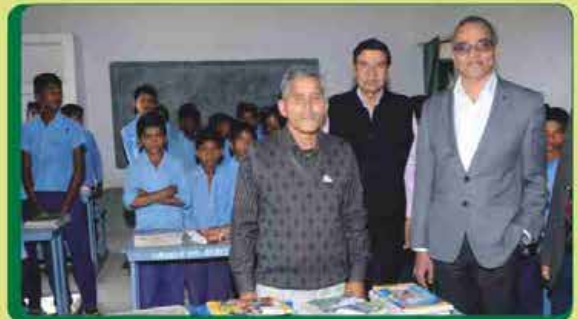
यूपीएल मेधावी छात्र पुरस्कार तथा डेस्क-बैच्य प्रदत्त