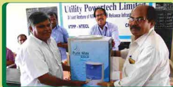
वाटर-फिल्टर का वितरण