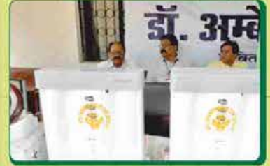
वाटर-फिल्टर का वितरण