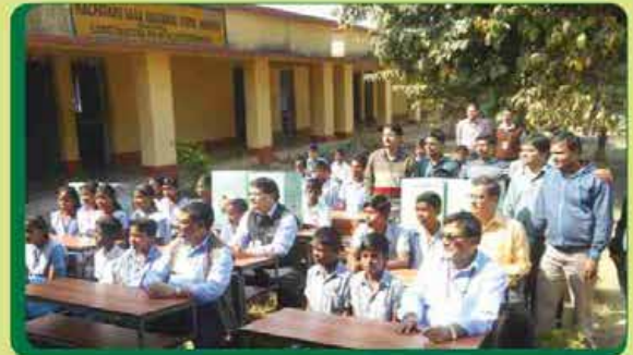
बैठने हेतु छोटी दरी तथा डेस्क-बेन्च का वितरण