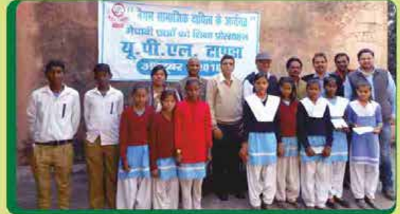
स्कूल-बैग तथा यूपीएल मेधावी छात्र पुरस्कार का वितरण