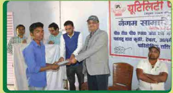
यूपीएल मेधावी छात्र पुरस्कार प्रदत्त