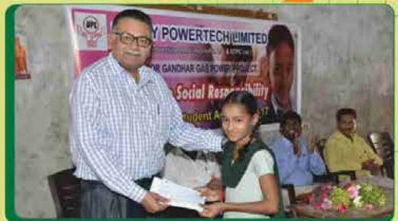
यूपीएल मेधावी छात्र पुरस्कार