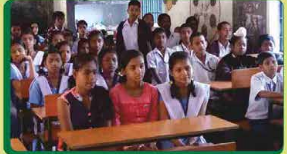
यूपीएल मेधावी छात्र पुरस्कार तथा डेस्क-बेन्च प्रदत्त