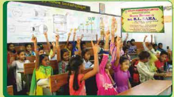
मध्याह्न भोजन हेतु थाली-गिलास, अलमीरा एवम् डेस्क-बेन्च का वितरण