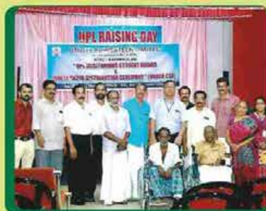
व्हील चेयर का वितरण