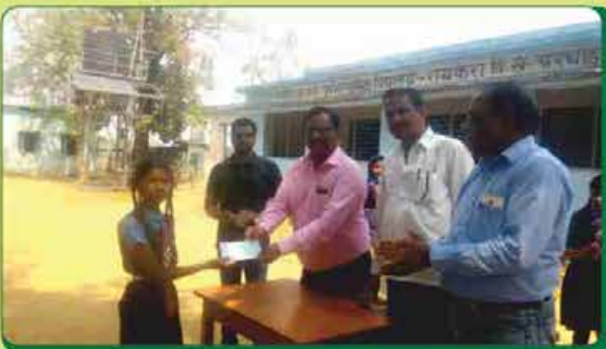
यूपीएल मेधावी छात्र पुरस्कार प्रदत्त