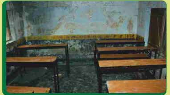
यूपीएल मेधावी छात्र पुरस्कार तथा डेस्क-बेन्च प्रदत्त