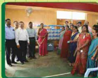
साह्तर स्केल का वितरण