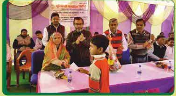
डेस्क-बेन्च तथा यूपीएल मेधावी छात्र पुरस्कार प्रदत्त