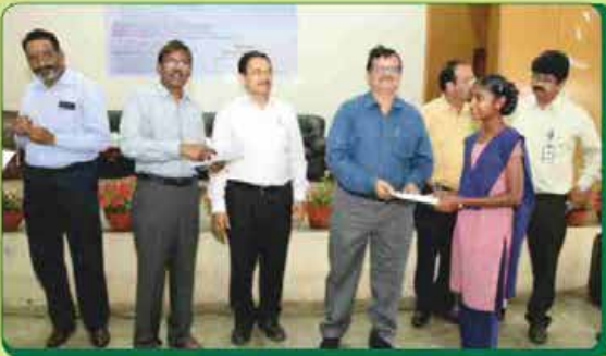
यूपीएल मेधावी छात्र पुरस्कार प्रदत्त