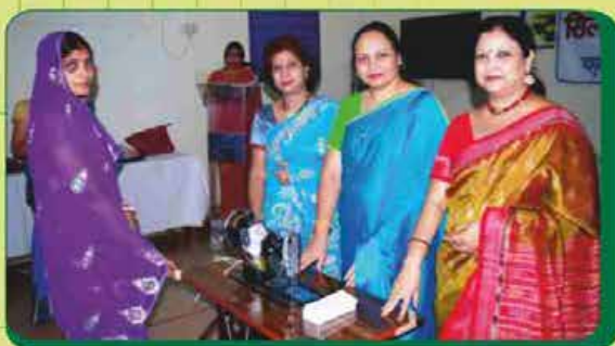
प्रशिक्षित ग्रामीण महिलाओं में सिलाई मशीनों का वितरण