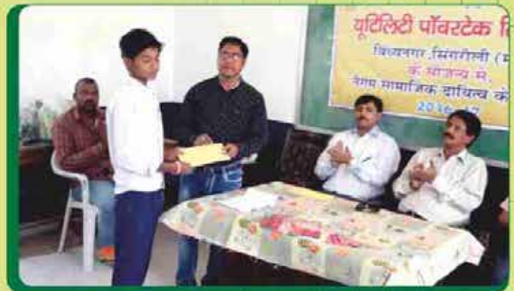
डेस्क-वेन्च तथा यूपीएल मेधावी छात्र पुरस्कार का प्रदान