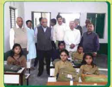
स्कूल-बैग एवम् डेस्क-बेन्च का वितरण