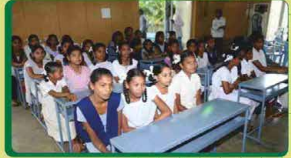
साईकिल तथा डेस्क-बेन्च का वितरण