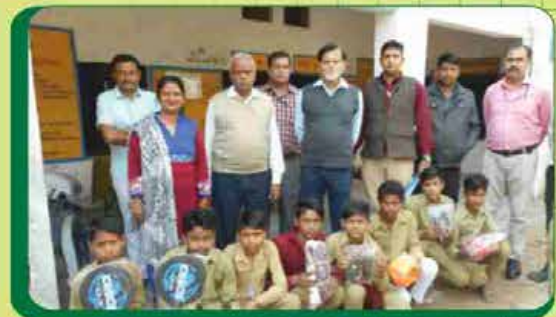
विभिन्न खेल सामग्रियों का वितरण