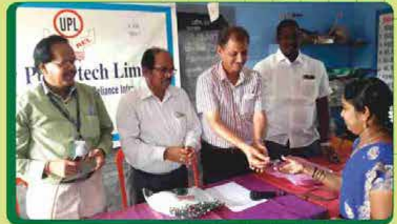
यूपीएल मेधावी छात्र पुरस्कार तथा अलमारी का प्रदान