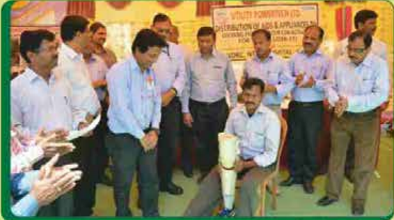
दिव्यांगों के लिए कृत्रिम उपकरणों की भेंट