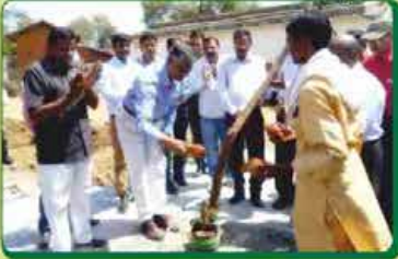
प्रदत्त हैंड पम्प के लिए बोरिंग का परिदृश्य