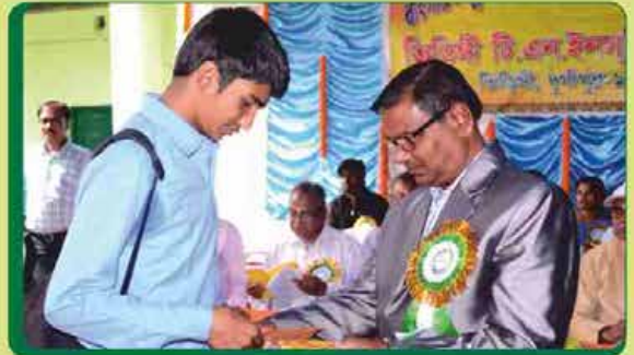
कम्प्यूटर तथा यूपीएल मेधावी छात्र पुरस्कार