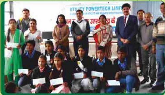
यूपीएल मेधावी छात्र पुरस्कार प्रदत्त