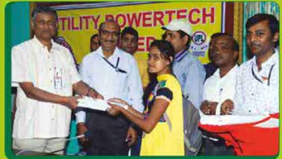
यूपीएल मेधावी छात्र पुरस्कार प्रदत्त