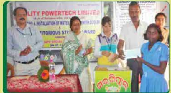
यूपीएल मेधावी छात्र पुरस्कार प्रदत्त