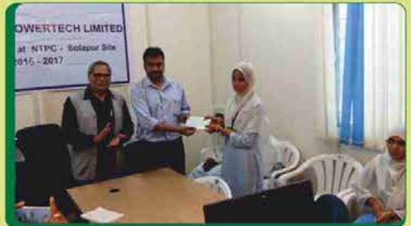
यूपीएल मेधावी छात्र पुरस्कार प्रदत्त